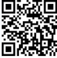
Ghost Boys by Jewell Parker Rhodes